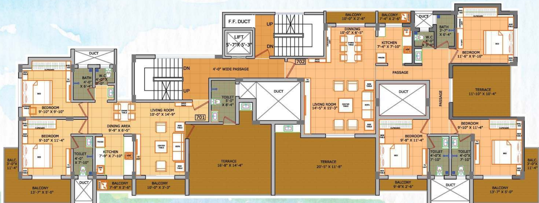
7TH FLOOR PLAN