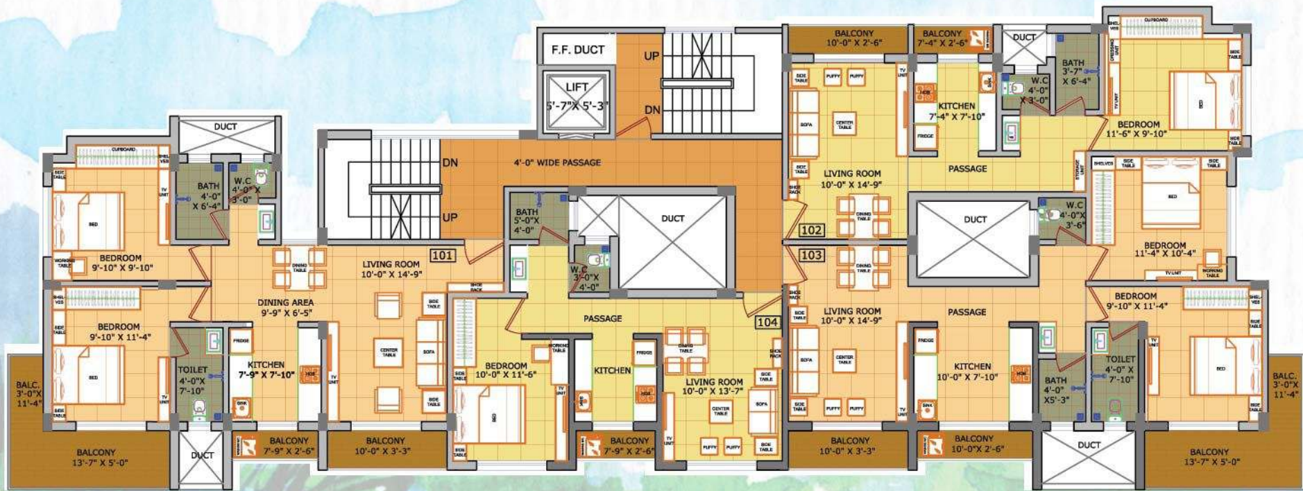
FIRST TO SIXTH FLOOR PLAN